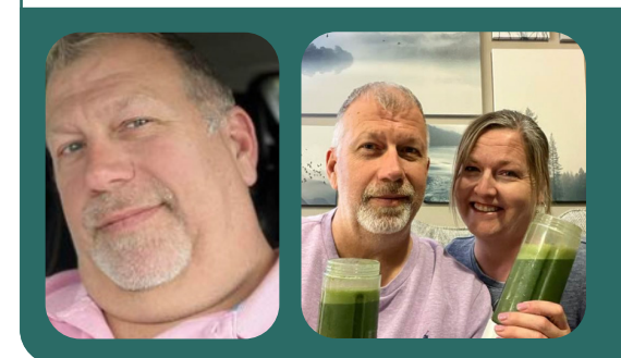
Ultimate Lifestyle Transformation